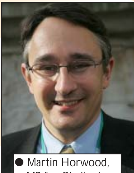
● Martin Horwood, MP for Cheltenham