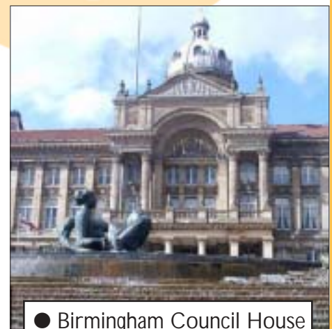
● Birmingham Council House

House is close to public transport, and has disabled access. A booking form is on page 3.